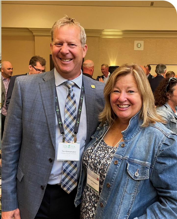
Left: Annual Federal Provincial Territorial (FPT) Agriculture Ministers Roundtable, which took place at the CFA Summer Meeting.