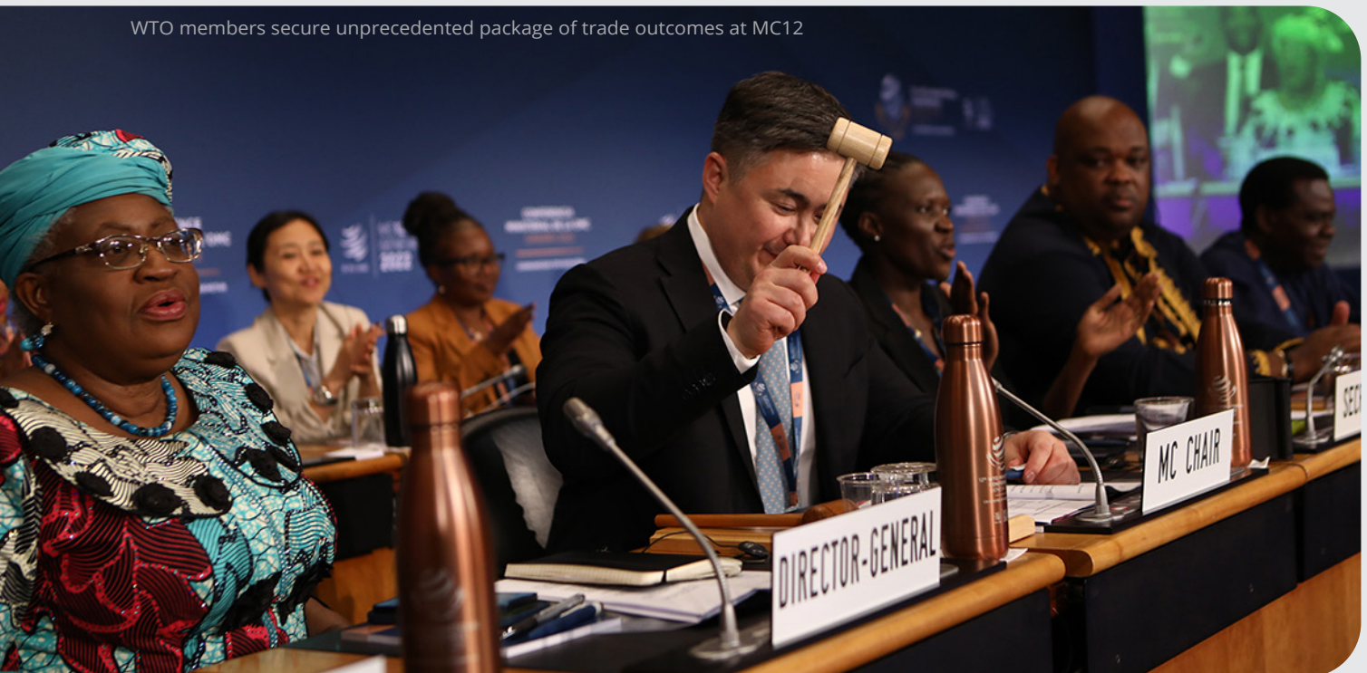
WTO members secure unprecedented package of trade outcomes at MC12

The negotiations with Mercosur (comprised of Argentina, Brazil, Paraguay, and Uruguay) and ASEAN (Brunei Darussalam,